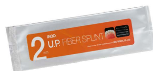
U.P. Fiber Splint #2 Refill 2mm x 200mm x 2pcs