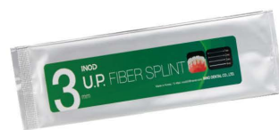
U.P. Fiber Splint #3 Refill 3mm x 200mm x 2pcs