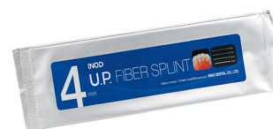
U.P. Fiber Splint #4 Refill 4mm x 200mm x 2pcs