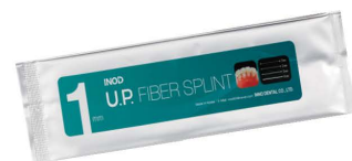
U.P. Fiber Splint #1 Refill 1mm x 200mm x 2pcs